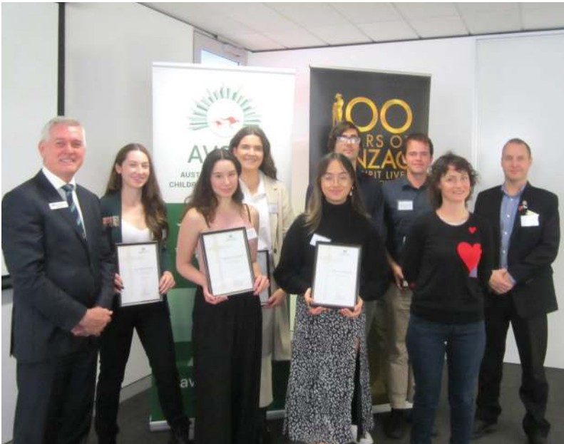
WA Scholarship & Long Tan Bursary Presentation

The Chair is a director. Each of the member organisations appoints a director and each Director may appoint an Alternate with the agreement of their appointing organisation. All the Directors of the Company have experience in matters associated with the support and welfare of veterans and their families in necessitous and